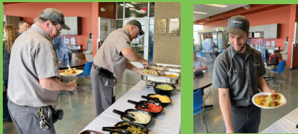
A delicious Taco Bar was enjoyed by all shifts.

Celebration was in abundance at GOEX as we took part in a variety of festivities in honor of all our dedicated employees for National Employee Appreciation Day March 4, 2022.