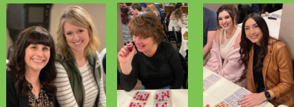
Prizes and comradery abounded at our joint Bingo Night with Prent Corporation.

In addition, Car Wash Tokens and Gas Cards were given out to lucky winners. Thank you every one. We truly appreciate all you do for GOEX!